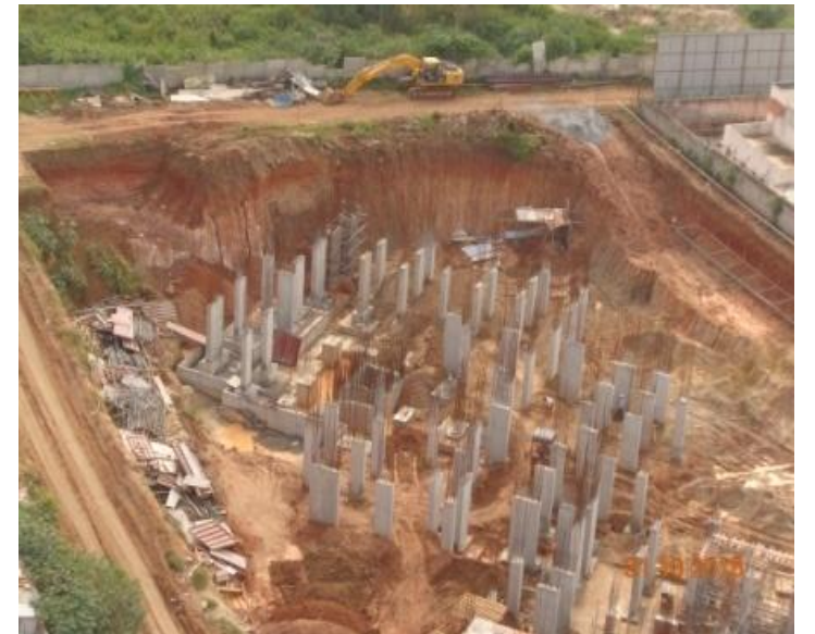
TOWER L, M & N : Lower Basement Column Casting Works in Progress