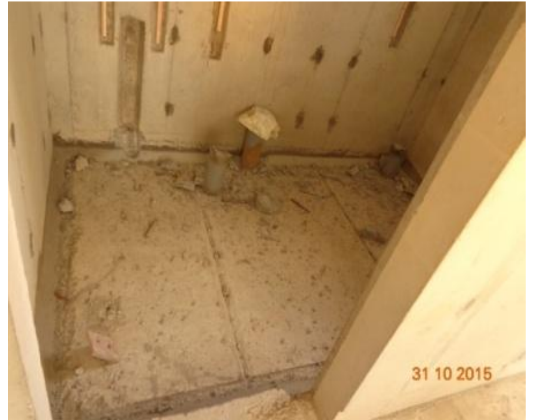
TOWER E : Level 16 Terrace work and Level 10 Toilet Bore Packing Works in Progress