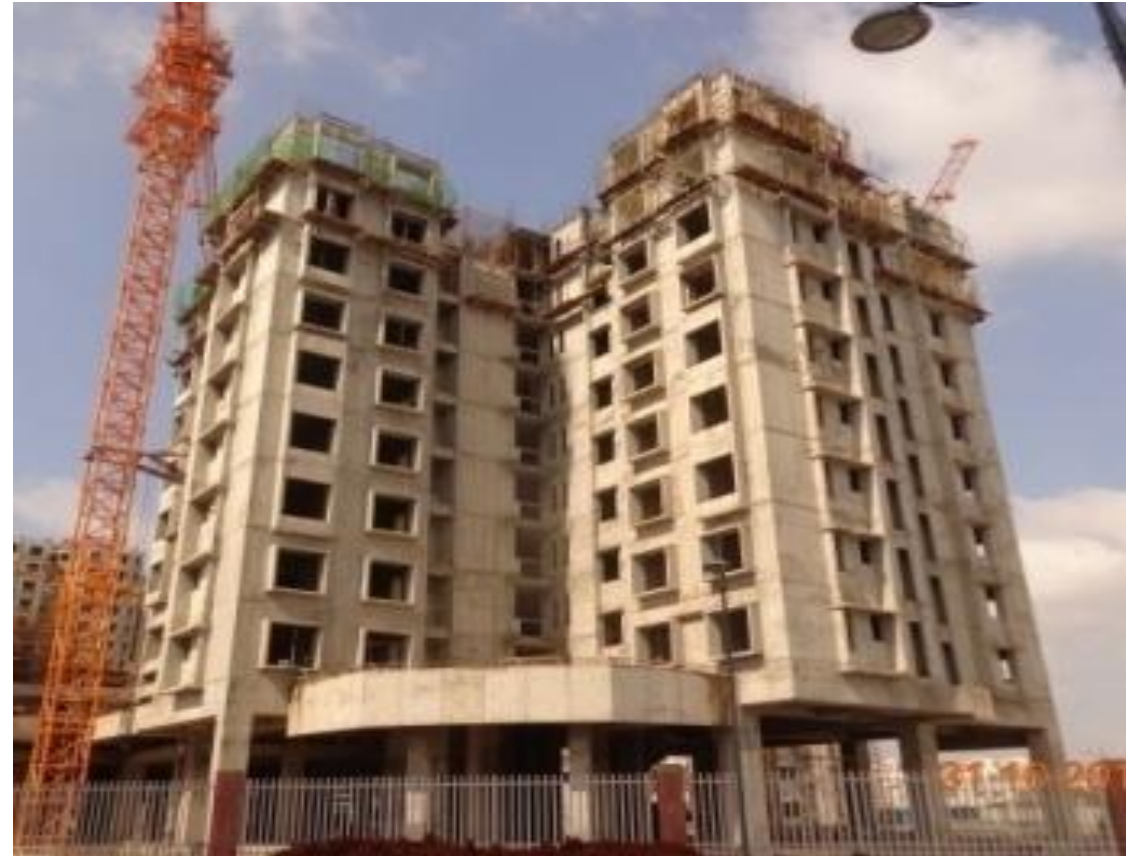
TOWER B : Level 11 Roof Shuttering and Reinforcement Works in Progress