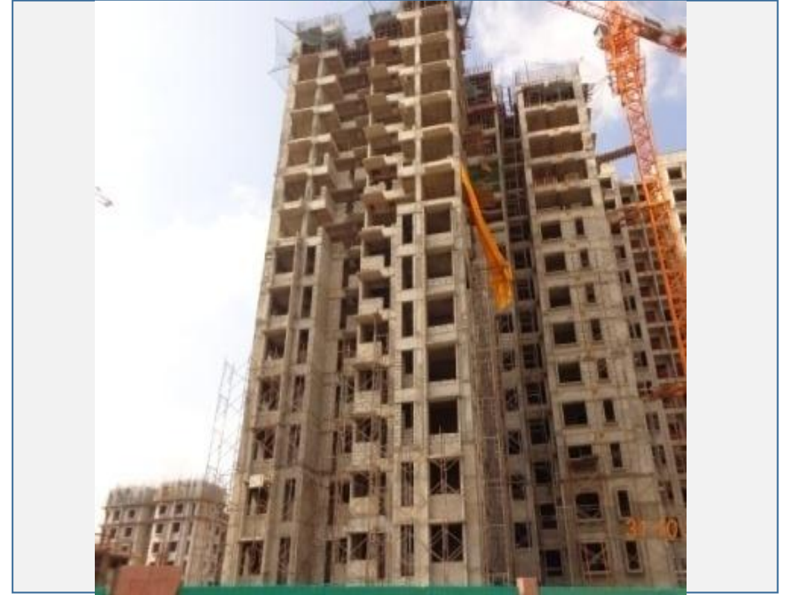
TOWER C : Level 16 Roof completed