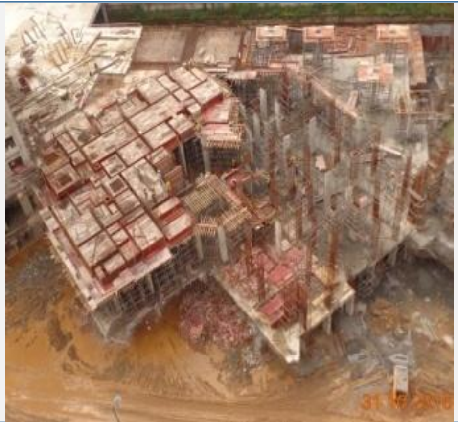
TOWER J : Upper Basement Column Casting , Slab Shuttering & Reinforcement Works in Progress .